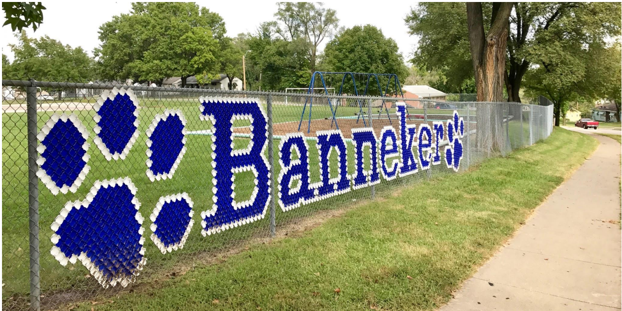
Playground at Benjamin Banneker Elementary School

There are no benches, lights, restrooms or water fountains outside. While the recreational area is ADA accessible, there is no ADA playground equipment. The recreational area is fenced in and there are shade trees along the fence. The gates are locked prohibiting public access during and after school hours. The complete playability checklist is at the end of this report.