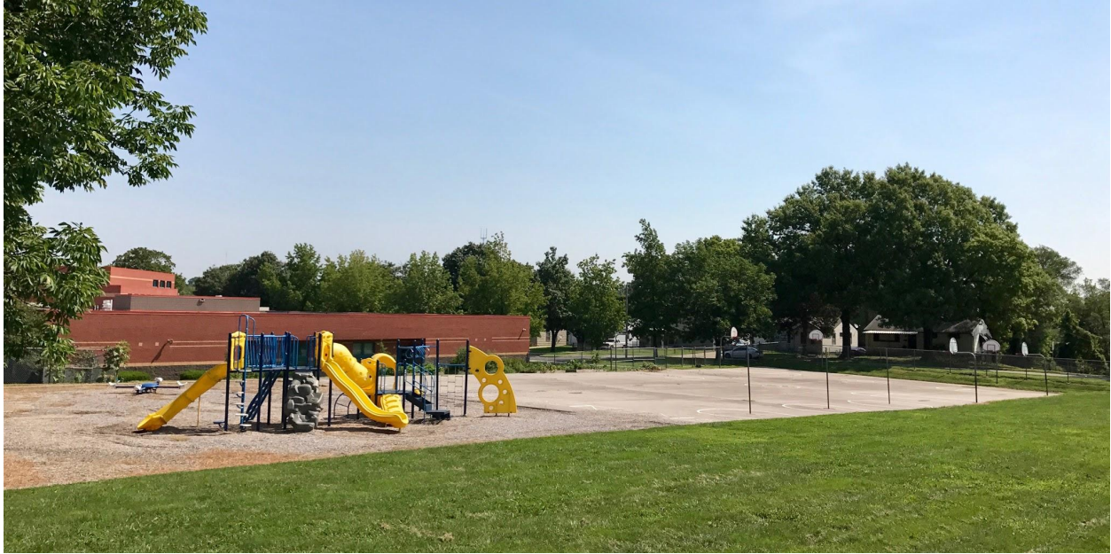
Playground at Benjamin Banneker Elementary School

There are no benches, lights, restrooms or water fountains outside. While the recreational area is ADA accessible, there is no ADA playground equipment. The recreational area is fenced in and there are shade trees along the fence. The gates are locked prohibiting public access during and after school hours. The complete playability checklist is at the end of this report.