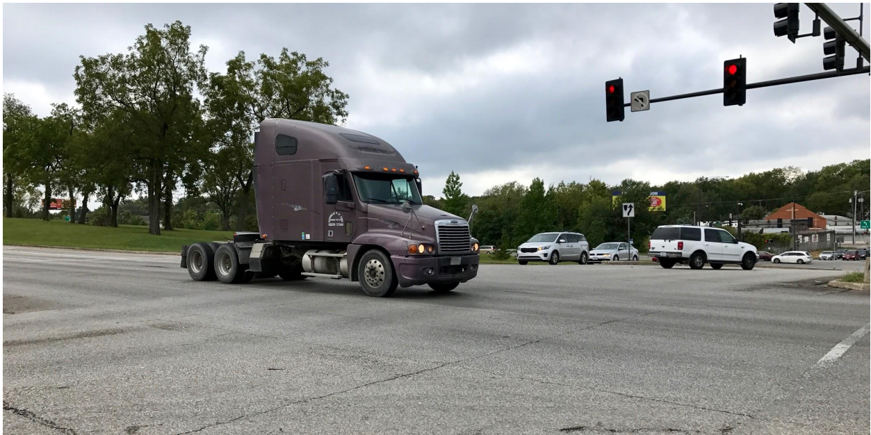
Bruce R. Watkins Drive/Highway 71 at Gregory Boulevard

As seen on the neighborhood map, a play desert is roughly located between E 67th Street and E 70th Street, north to south, and Bellefontaine Avenue and Chestnut Avenue, east to west. The closest school is Benjamin Banneker Elementary located at 7050 Askew Avenue. The school is accessible to all of the neighborhood, except the small strip on the west side of Bruce R. Watkins Drive/Highway 71. Because of the amount and speed of traffic, it is unsafe for kids to cross this road without adult supervision.