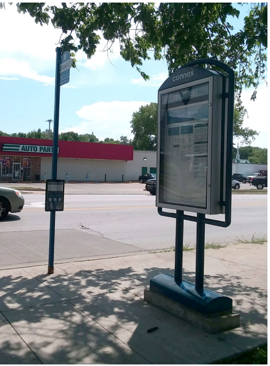
"I don't have income to ride a bus. I have to depend on my mother, who's disabled, to take me to a grocery store. Most of the time I don't want to bother her. I have to just suffer and get chips and drinks from a gas station that is closer than anything."