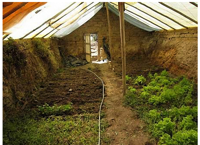
“Walipini 2” by Aerin Aichi is licensed under CC 2.0 Generic

Walipinis are another type of protective structure. The term “walipini” comes from the Aymara Indian language and means “place of warmth.” Walipinis are essentially large underground hotbeds that do not require external heat sources. Instead, they leverage the consistent ambient geothermal heat from the surrounding ground to keep them warm. They are typically built about six feet underground and earth is used for the walls, so costs of construction tend to be lower than for above-ground greenhouses. The roof is made of plastic sheeting, which also allows for